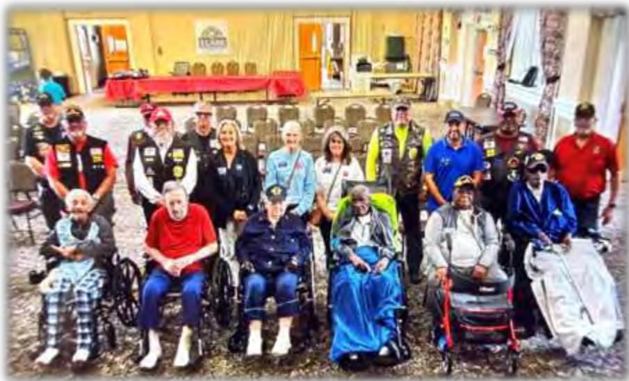
Members of the Post and Auxiliary Unit 193 attended the Dorn VA Annual Memorial Day ceremony and assisted in getting veterans from the Long Term Care Facility to the event.