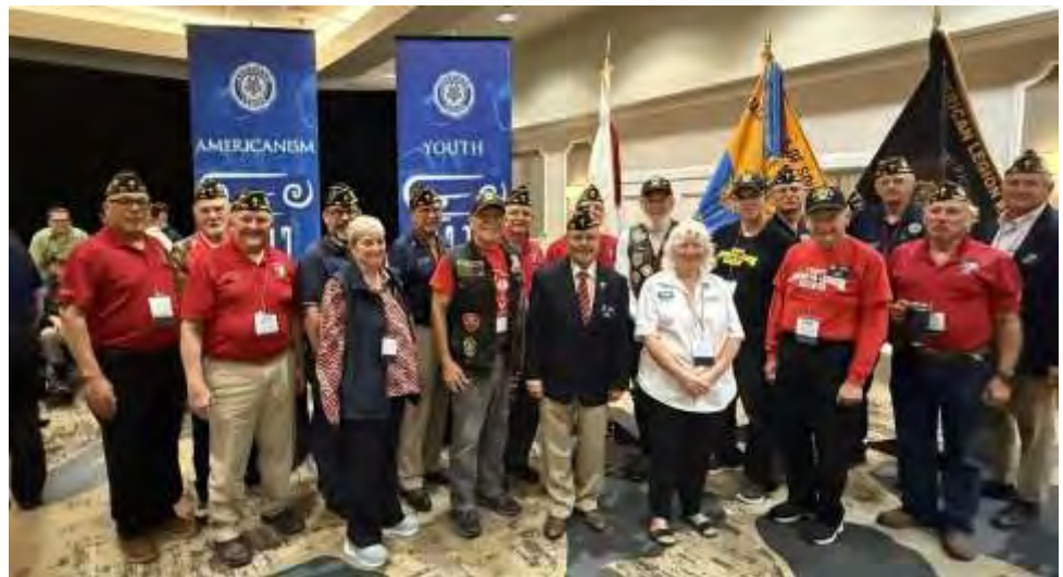
Chapin American legion Post 193 Delegates to the 2026 Department Convention