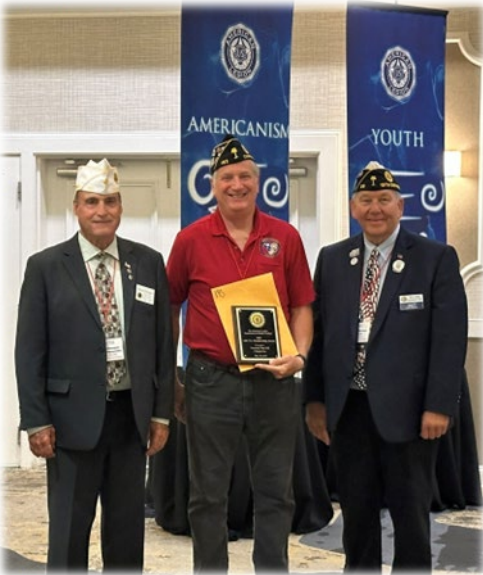
Post 193 received several awards during the 2025 annual convention