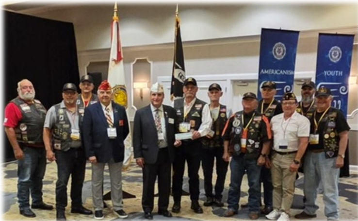
ALR Chapter 193 presenting a check to the Department Commander for the Veterans and Children Fund (Legacy Fund)