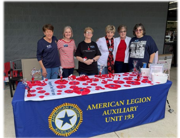
National Poppy Day at Boland's Ace Hardware