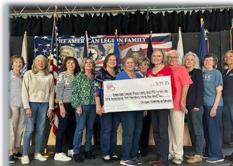
Chapin Women in Service presented Scholarship money for three girls to attend Palmetto Girls State