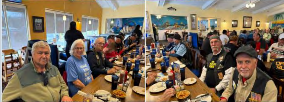
After the ALRSC Spring meeting members of ALR 193 and a couple guest from North Augusta Chapter 71 took a ride up to have lunch at the Blue Ocean Restaurant in Clinton. Great weather, Great Ride Good times!