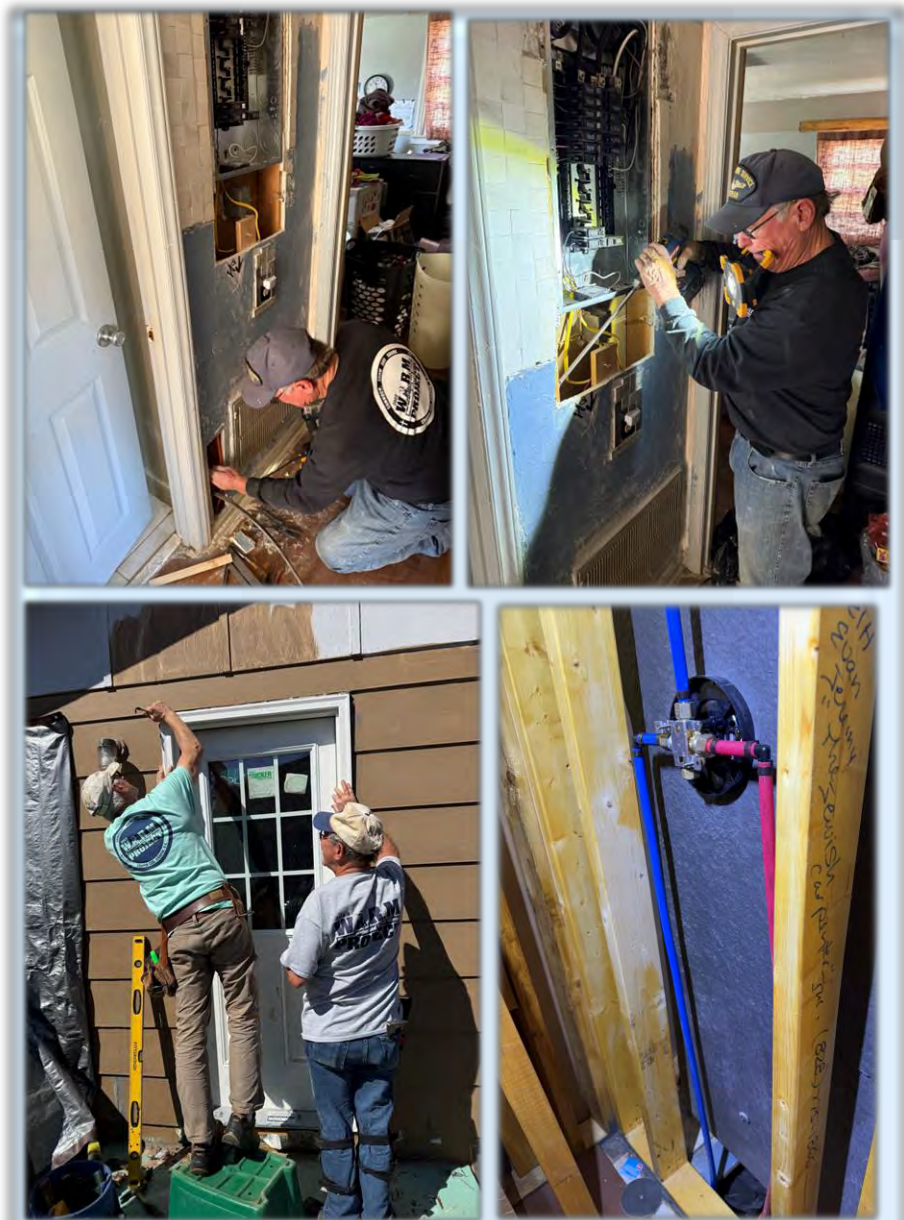
Members of Post 193 utilized some of the funds donated by Chapin's Post 193 American Legion Riders to install water and electric lines for a washer & dryer, rewire the service panel, repair a dishwasher, and install a exterior door for a single mother's home that was severely damaged during Hurricane Helena. (25 March 2025, Swannanoa, NC)

Membership matters! American Legion Post 193 and our American Legion Family are making a difference locally and across the State! You may not be the member rewiring the electrical panel, but you may have been the one providing funds either directly or through participation in one of the many fundraisers we hold. None of us can be everywhere and do everything but we can do what we can do no matter how big or how small, every little bit helps.