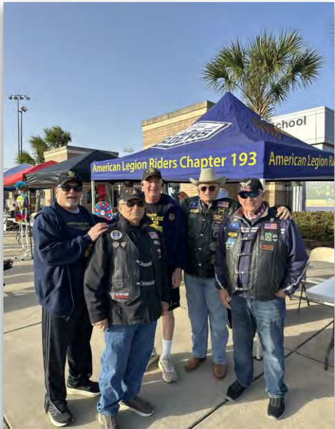
ALR 193 came out in support of the Chapin NJROTC Color Run.