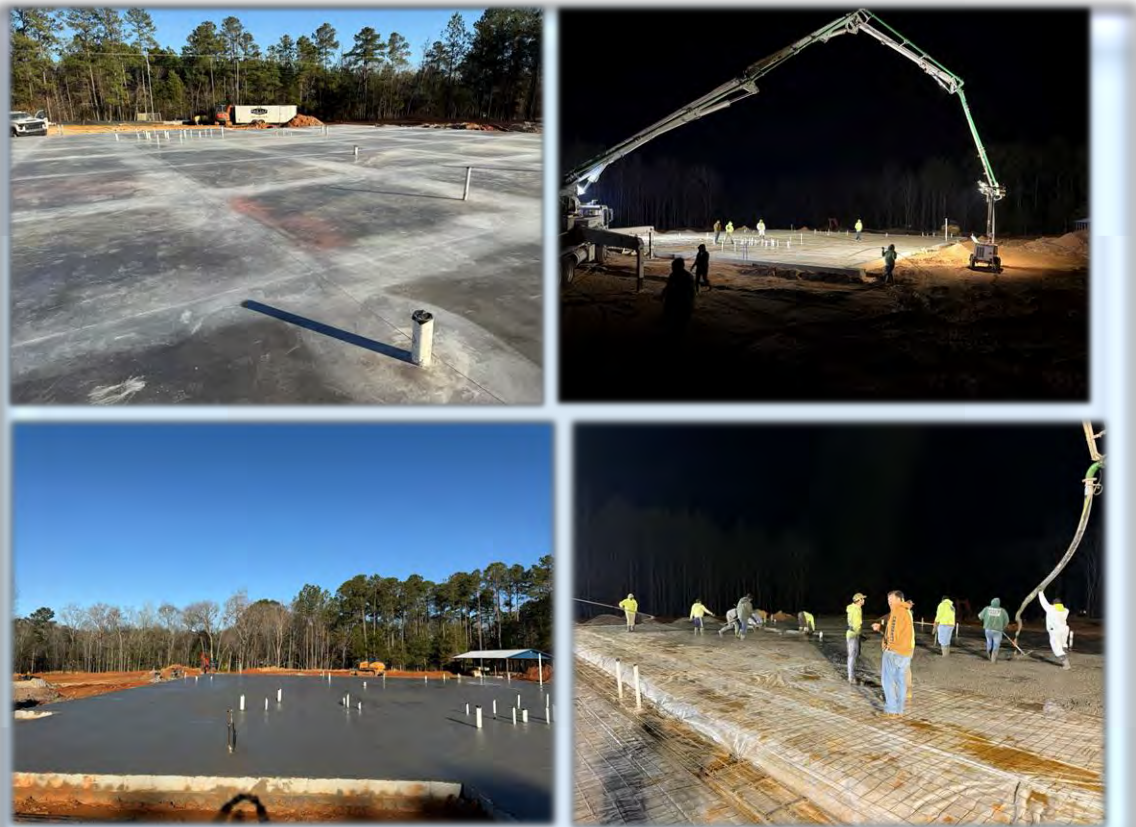
There is a lot going on out at the Future Post Home of Chapin American Legion Post 193. Fundraising for the Building Fund continues to be our primary task.