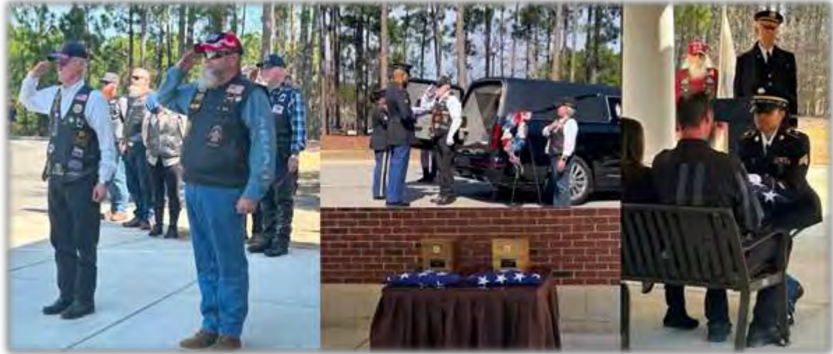
Post 193 Unclaimed Veteran burial service at the Ft. Jackson National Cemetery for two Previously Unclaimed Veterans. " You Are Not Forgotten"