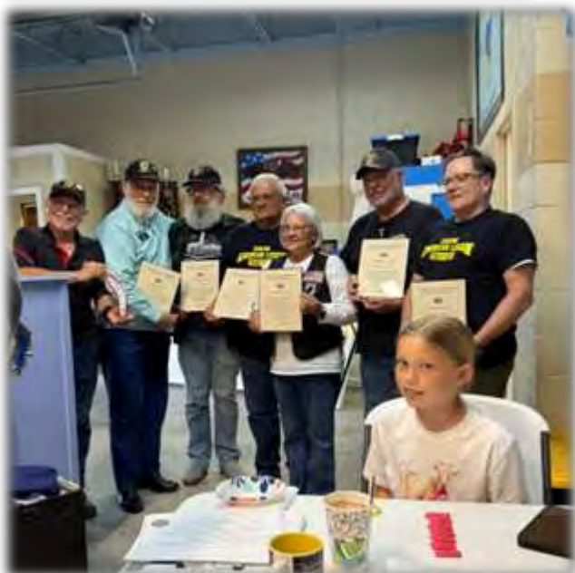
(L) Chapter 193 members received certificates for completing all requirements to receive the ALRSC Unity Patch