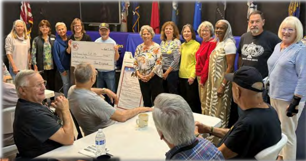
Chapin Women in Service (CWIS) visited our Monday morning Veteran breakfast and brought a nice $10K donation to the Building Fund