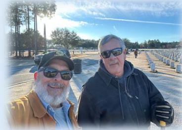
Post 193 Sgt at Arms was on hand to be sure all went well, and things were orderly