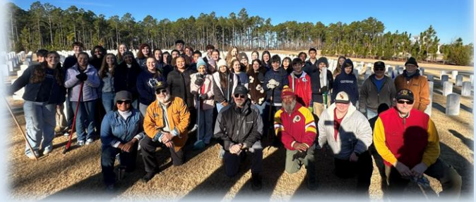
A great crowd of folks came out to clean up the Veteran wreaths at the FJNC and we were done in under two hours.