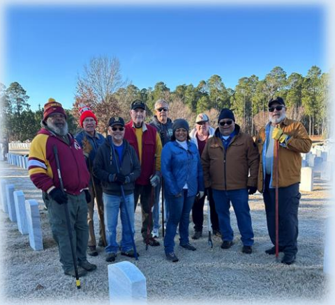
Members of Post 193 and a couple of potential members had a great time recovering wreaths at FJNC