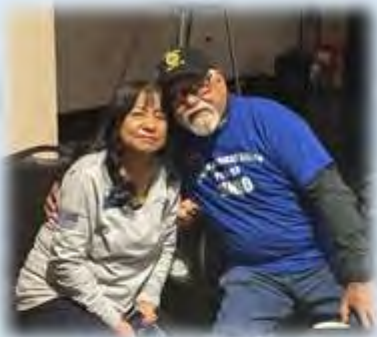
American Legion Post 193 BINGO is a family affair!

Some of our Post 193 BINGO Team members relaxing before the games begin. Thanks to ALL