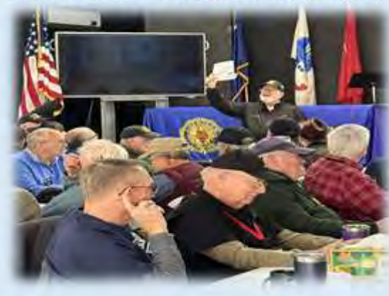
Breakfast continues to go well. "I have three short announcements!"