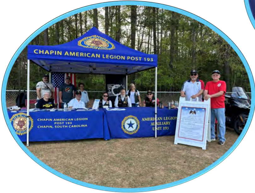
We had a great time visiting Chapin Elementary School and participating in the meet and mingle event