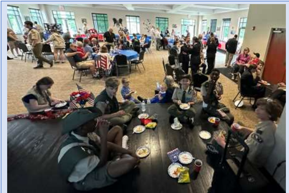
The Memorial Day Reception was well planned and executed! Most of All everyone enjoyed it. Great Job Unit 193!!