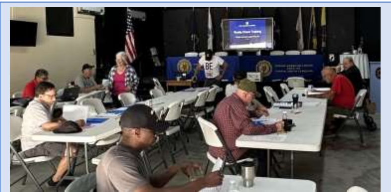
Our "Be The One Team" Great work !