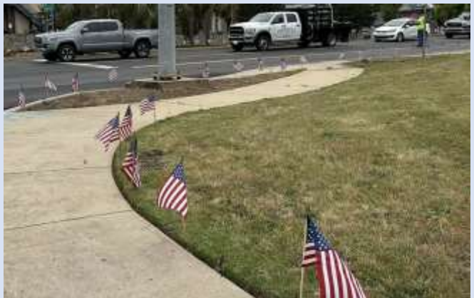
The Boot Drive was a huge success and we received many positive comments on the beautiful display of flags in the Town Center!!