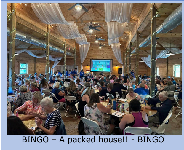
BINGO – A packed house!! - BINGO