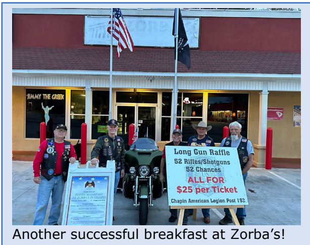
Another successful breakfast at Zorba's!